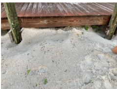
Yes, there's a large turtle under there!

We did record a higher than usual number of Obstructed Nesting Attempts. Seven mama turtles encountered some type of man-made obstruction (sand fence, dune walkover, etc.) and 5 of them were able to eventually deposit eggs. One of these was our sole green turtle, who became stuck under the Davis St. walkover and needed our assistance to extricate herself. Greens dig very deep nests and throw a huge amount of sand, so the more she dug and threw, the tighter she was wedged under the boards. She was freed with the help of three BSTP volunteers and a bystander.