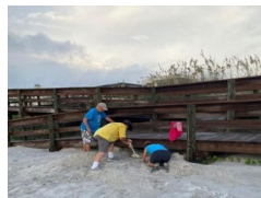
Digging her out